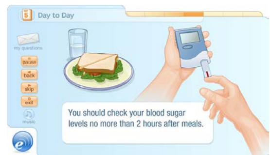
© 2013 Emmi Solutions, LLC Diabetes Carb Counting program

ACCESS YOUR EMMI PROGRAM TODAY VISIT WWW.GOEMMI.COM AND ENTER CODE: SIHDIABETES